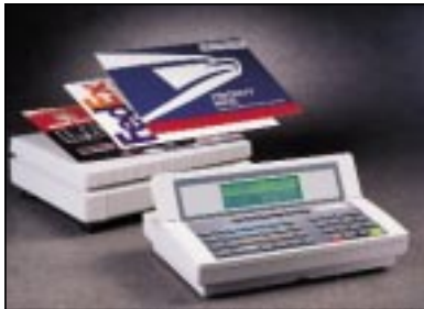
Optional 5, 10, 30 and 70 pound scales interface with the IJ75 for weighing items and automatically setting the correct postage.