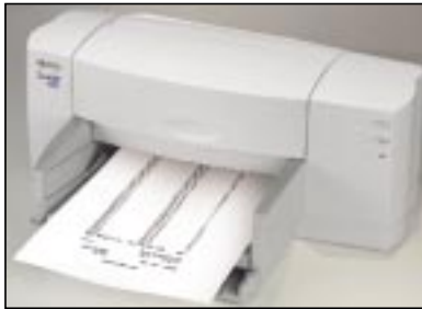
An optional printer can be added to print 8.5"x11" postage accounting reports.