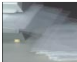
The IJ75 processes envelopes up to 5/8" thick – even the more difficult portrait style flats.