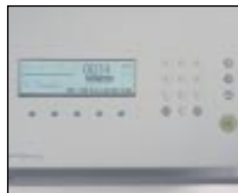
Up to ten preset memory keys prevent errors and save time for recurring mailings.