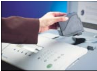
The Hewlett-Packard "Click n' Snap™" ink cartridge makes re-inking a snap, with no mess.