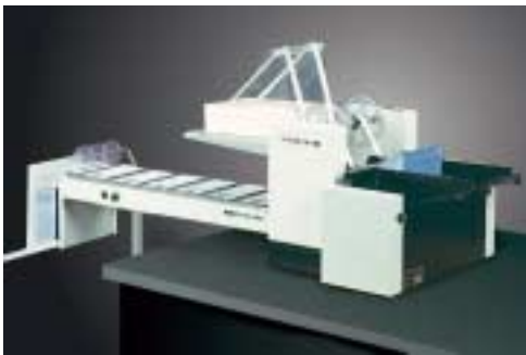
RENA's UT-361 shown in-line with a RENA AF-371 Feeder and RENA TB-356 Conveyor Stacker. The UT-361 can easily process 24,000 mailing pieces per hour.

Applies paper, translucent or clear film tabs. The UT-361 applies round or square tabs and even applies clear tabs that won't interfere with mailpiece design.