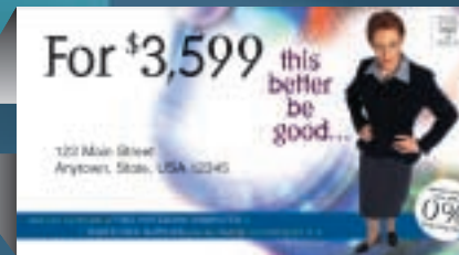
Variable Image Printing

There's never been a better time to discover the power of color —and how it can impact your business. Make your documents come to life with vivid 600-dpi resolution on paper sizes up to 12" x 18". The AR-C270 IMAGER can even print on paper up to 140 lb. Index—so you can print almost anything you can imagine! Communicate your ideas effectively with eye-catching reports, signage, colorful charts, and customized marketing communications. Unleash your creativity and enhance your business image with the ARC-270 Color IMAGER.