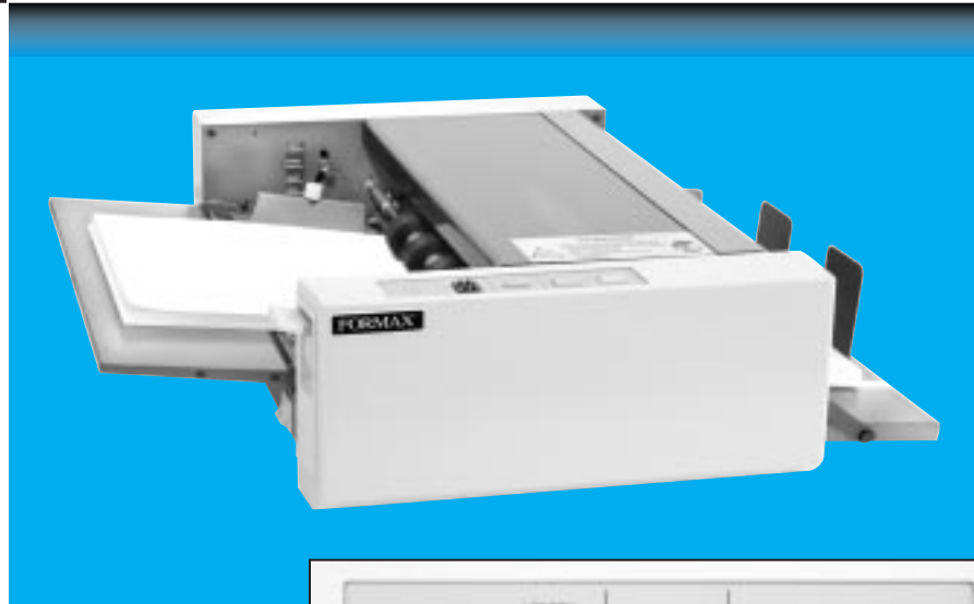
Operator Friendly Control Panel